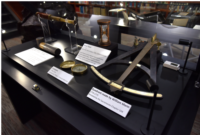
From the SAR Institutional Archive, 1901 Congress Memorabilia