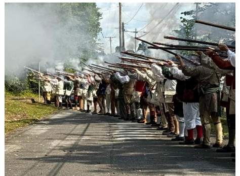
Blue Licks Memorial Ceremony – August 17, 2024