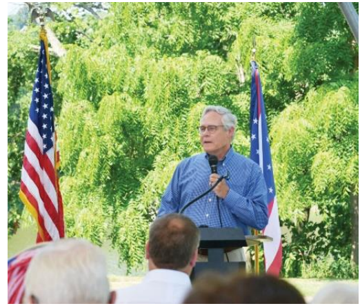
July 13 Marietta celebrates 237 th Anniversary of NW Territory Ordinance