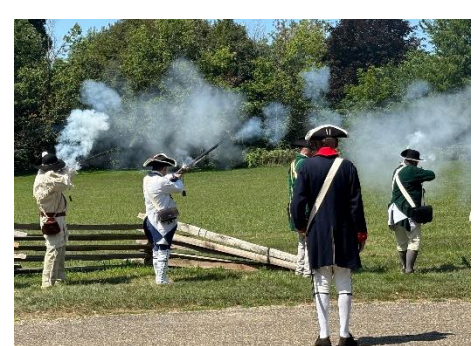
Fort Laurens – July 26-27, 2024