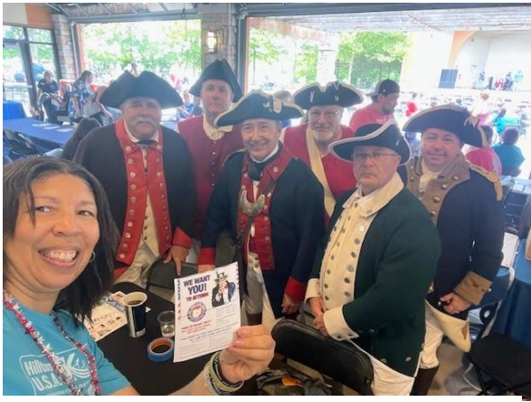
Columbus Zoo - July 6 - promoting membership, youth contests and Liberty Camp