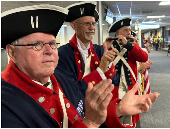
Honor Flight @ Dayton - August 10, 2024