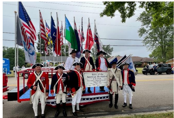
Various Chapters participated in Independence Day parades – July 4, 2024