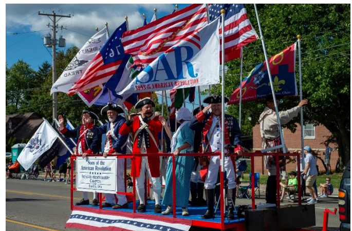
Labor Day parade in Kettering, Ohio September 2, 2024