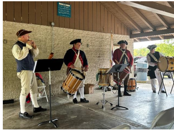
Colonial music program – August 16, 2024