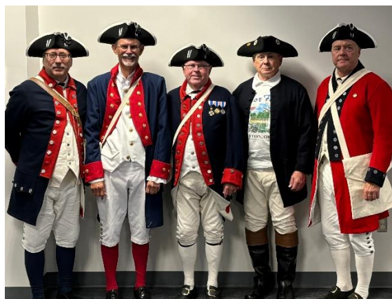
Honor Flight at Dayton airport. Sept 21, 2024

Submit your photos for the next Ohio Country Bulletin to skpk1984@aol.com