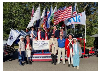
Labor Day parade