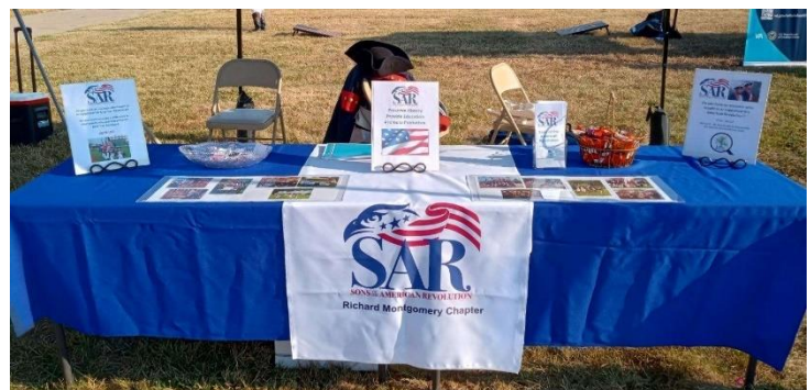
Richard Montgomery Chapter's information booth at Patriot Salute - Dayton VA - Sept 14., 2024