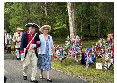
Presenting wreath at Blue Licks Ceremony