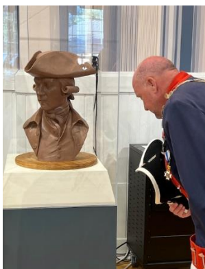
Cincinnati and Richard Montgomery Chapters attended the unveiling of the bust section of Maj. Gen. Dr. Joseph Warren statue. Sept 10, 2024 - Lebanon