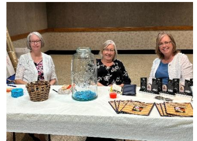
Ladies Auxiliary assist at the Anthony Wayne Memorial