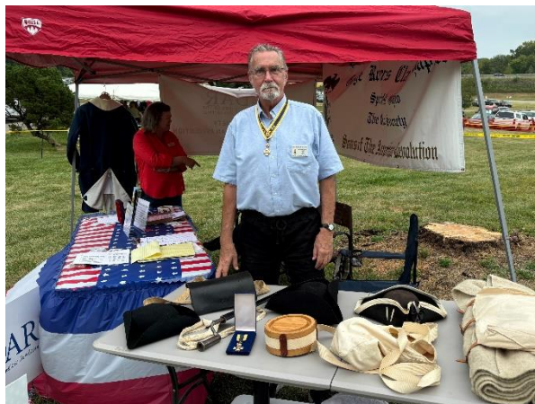
George Roger Clark Chapter's info booth at the "Fair at New Boston" – Aug 31-Sept 1, 2024