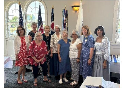
Fort Laurens 2024