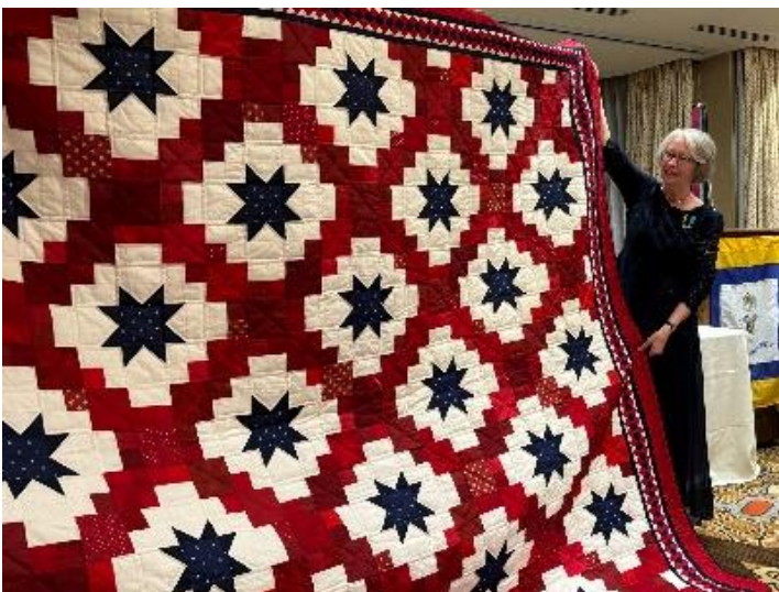
Quilt Raffle 2024-2025