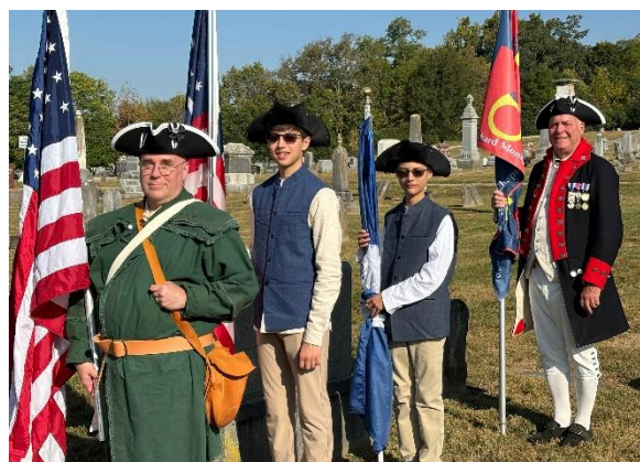
Mary Van Cleve C.A.R. and Richard Montgomery SAR provide color guard for Jonathan Dayton DAR chapter grave memorial. Sept 21, 2024