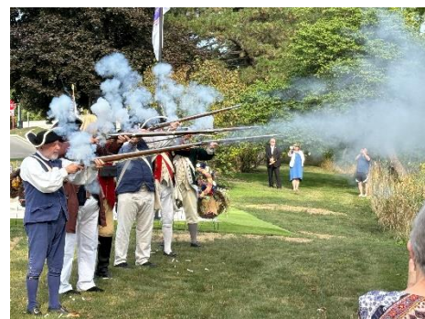
Anthony Wayne Veterans' Memorial - Northwest Territory Chapter – August 24, 2024