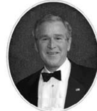
George W. Bush