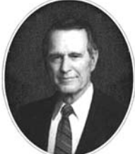
George H. Bush