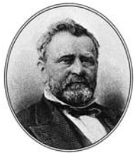
Ulysses S. Grant